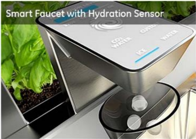
GE SMART APPLIANCES