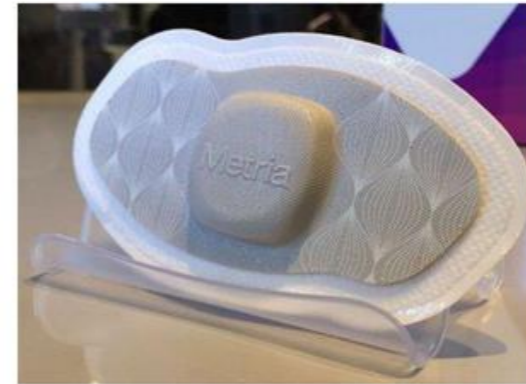
MERTIA BIO HEALTH PATCH