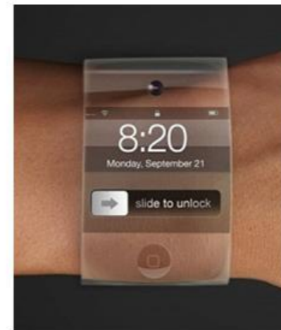
HEALTH INTEGRATED WEARABLES