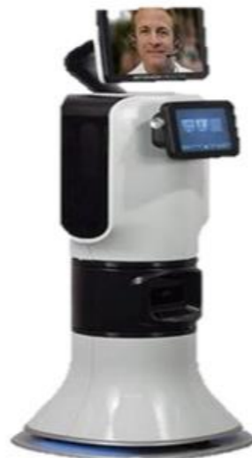
ROAMING CARTS FOR SPECIALIST INTERACTIONS